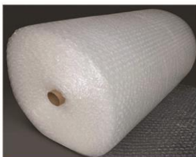
Air Bubble Wrap