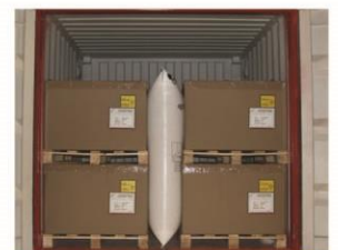
Dunnage Air Bags